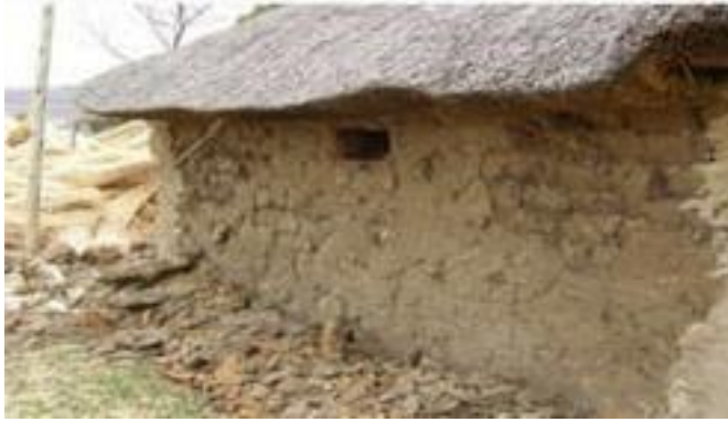
Figure.1 the origin of composite materials

The history of the creation of composite materials goes back to the beginning of the development of civilization. The history of man's use of composite materials has a long history, for the first time people learned the idea of composite materials from nature. The first bricks and pottery, found before 5000 BC, were considered to be complex sun-dried products. But it was observed that their shrinkage during cooking causes the product to crack. In order to prevent this phenomenon, since ancient times, sand and organic additives (such as straw, river reeds) were added to the clay-soil and a composite material was obtained [5].