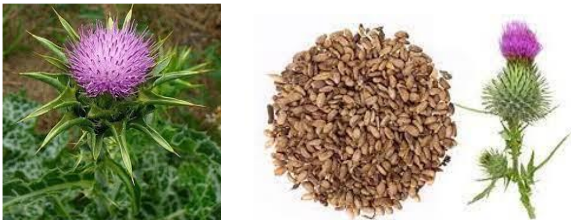
Picture. The flower and seed of the plant

It is also used in the treatment of varicose veins, polyarthritis, cholecystitis, liver dystrophy, poisoning, including alcoholism, diabetes and toothache. It is also recommended after radiation and chemotherapy courses.