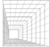
Figure 2.5. Methodological system for the development of a national worldview

control, obtaining independent education, getting used to reading books, knowing how to "read freely", being able to distinguish the main one,