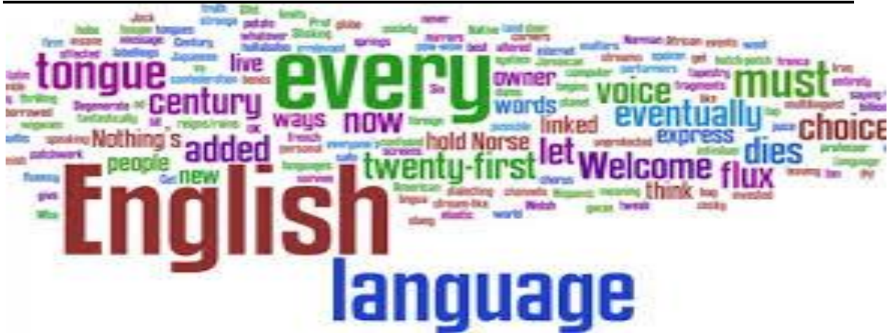
Image 1. English language.